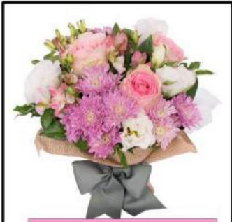
Simulation: Actual bouquet and vase will differ from flowers shown.

If you would be interested in ordering fresh flower bouquets, please call or fill out the order form shown below. A minimum of two special days or two bouquets is required. (You may order directly through www.mycalumetpark.com ). Payments may be made using your VISA, MasterCard, Discover Card or American Express. Call 219-769-8803 for telephone orders. Thank you for helping to beautify the cemetery.